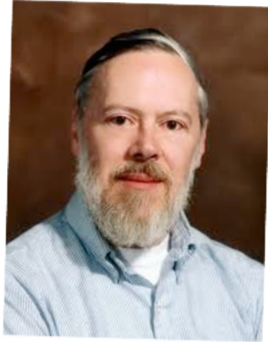
Dennis Ritchie 1971 C