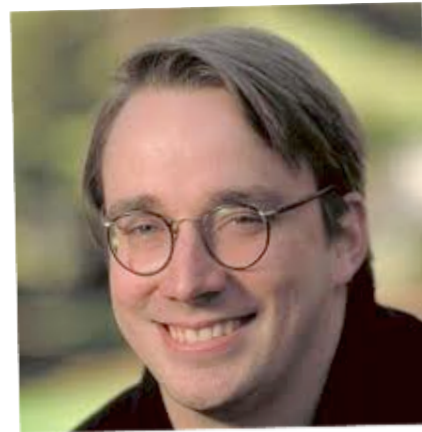
Linus Torvalds 1991 Linux kernel for personal computers