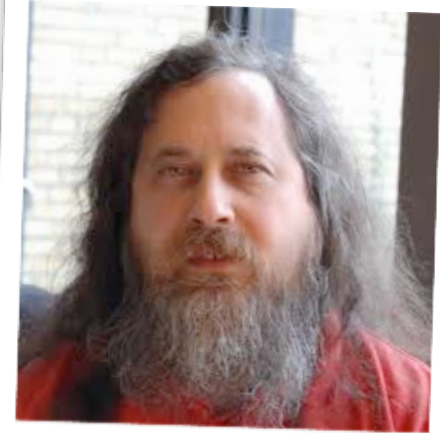
Richard Stallman 1983 Gnu Not Unix